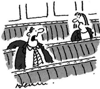
'Not all MPs are abusive and predatory – some of us are greedy and corrupt.'

Liberals – in the modern debased sense of the word – see black and Asian people as their needy clients – and indeed the general tenor of pretty much all BBC output – without being cast as bigot. And so, by and large, we stay shut: