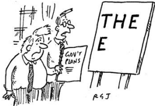
'It's the beginning of The End.'

These eight years, but all of them were killed because they were defending the right to be free, to join Europe and Nato and to choose the best for their country and their children. Ukraine isn't training out of soldiers. Volunteers are not just queuing up at military recruitment centres but, in some cases, trying to bribe their way in. Civilians have something to protect – and are ready to die for