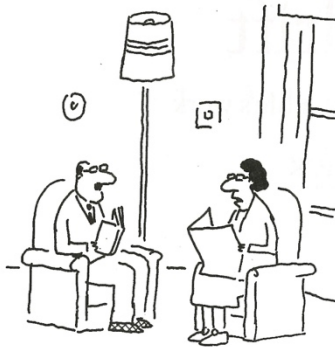
'I've forgotten what we used to do with our freedom.'