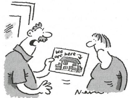
'It's a postcard from our neighbours on staycation next door.'