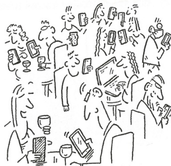
'Great to be out socialising again.'